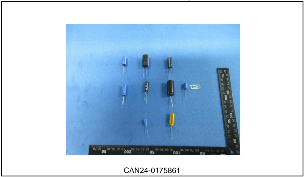
Photo of Submitted Sample

SGS authenticate the photo on original report only